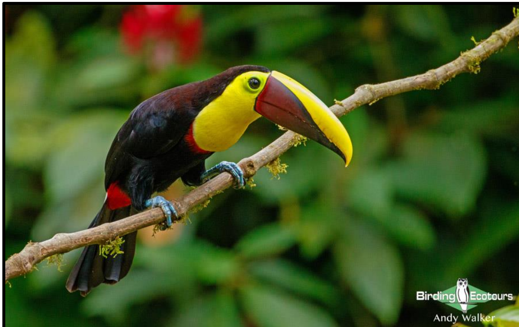
The outrageously colored Yellow-throated Toucan is often encountered on this tour.

Perhaps no other tour shows you such a large selection of classic and amazing Neotropical birds. During these 16 days we will look for Andean Condor , Andean Cock-of-the-rock , Giant Hummingbird , Torrent Duck , White-capped Dipper , Sunbittern , Sword-billed Hummingbird , Lyre-tailed Nightjar , Yellow-throated Toucan , Toucan Barbet , Choco Toucan , Plate-billed Mountain Toucan , Crimson-rumped Toucanet , Golden-collared Toucanet , Choco Trogon , Golden-headed Quetzal , Crested Quetzal , Scarlet-breasted Fruiteater , White-faced Nunbird , Powerful Woodpecker , Giant Conebill , Ocellated Tapaculo , Tanager Finch , Rufous-bellied Seedsnipe , and Oilbird .