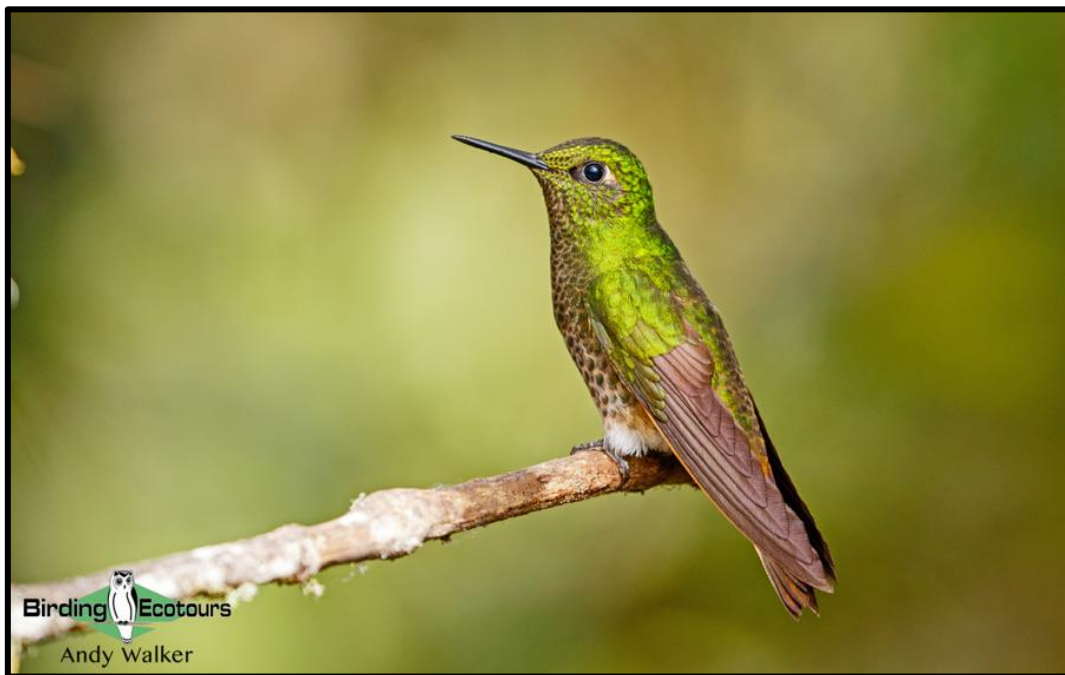
The feeders at San Isidro attract many hummingbirds such as Buff-tailed Coronet.