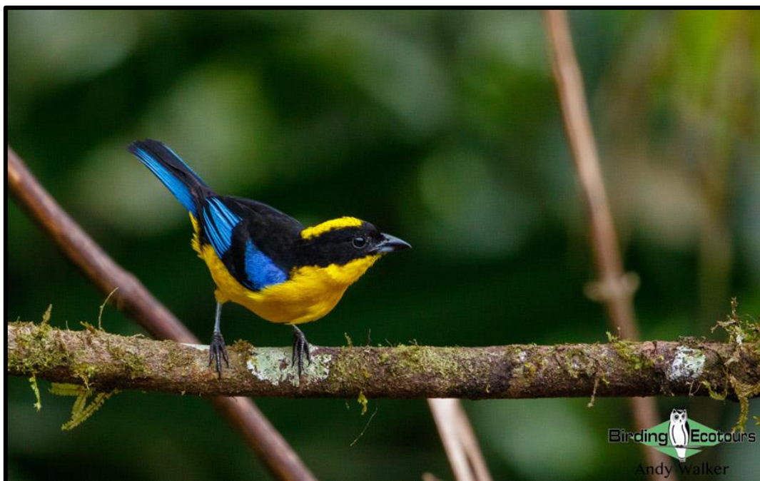
Bellavista Cloudforest is home to the gorgeous Blue-winged Mountain Tanager.

After an early breakfast we will visit the upper portion of the Tandayapa Valley and the Bellavista Cloud Forest Reserve. Here we will look for Toucan Barbet, Green-and-black Fruiteater, Masked Trogon, Blue-and-black Tanager, Blue-winged Mountain Tanager, Strong-billed Woodcreeper, Crimson-mantled Woodpecker, Cinnamon Flycatcher, White-winged Brushfinch, Grey-breasted Wood Wren, Grass-green Tanager, Andean Guan, and White-throated Quail-Dove. We will put all our efforts into localizing the most wanted Ocellated Tapaculo and Tanager Finch.