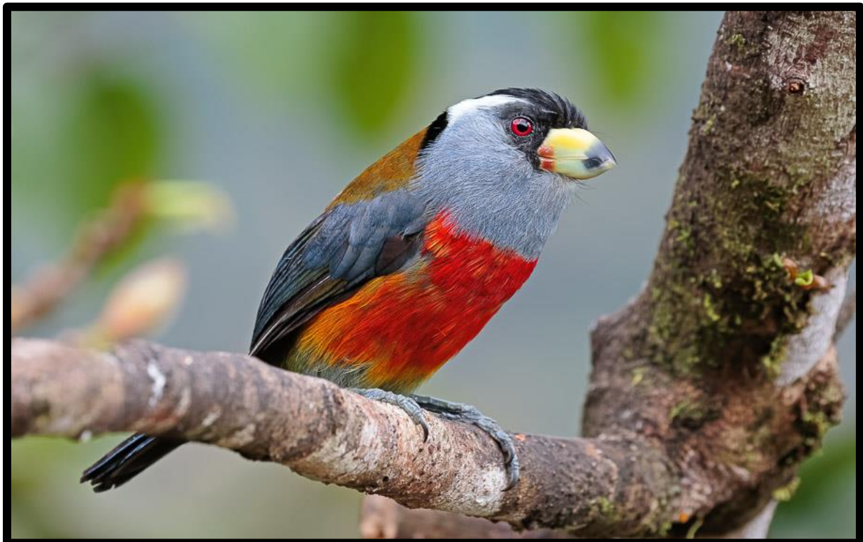
The gorgeous and characterful Toucan Barbet should be encountered on this tour.