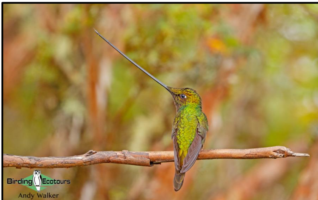
The spectacular Sword-billed Hummingbird