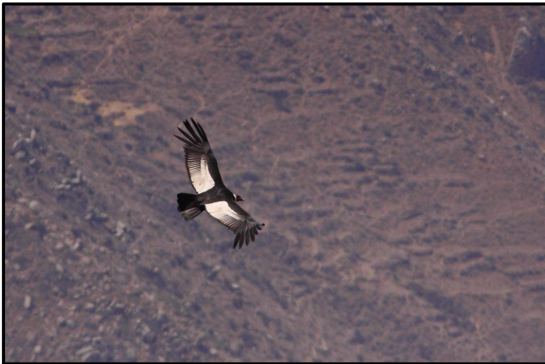
Andean Condor will be searched for in mountainous areas.

After a week on the western slope of the lower Andes we will climb up in elevation to the Antisana Ecological Reserve. The Antisana Volcano has a height of 5,704 meters (18,714 feet). The newly-formed Antisana Ecological Reserve was until recently a number of extensive ranches. Today it is a well-known nesting site for Andean Condor . We will enjoy a different birding day at high elevation, enjoying species such as Carunculated Caracara , Black-chested Buzzard-Eagle , Aplomado Falcon , Variable Hawk , Many-striped Canastero , Stout-billed Cinclodes , Chestnut-winged Cinclodes , Black-winged Ground Dove , Plumbeous Sierra Finch , Andean Lapwing , Silvery Grebe , Andean Coot , Andean Teal , Andean Gull , Andean Duck , Yellow-billed Pintail , Giant Hummingbird , and Ecuadorian Hillstar .