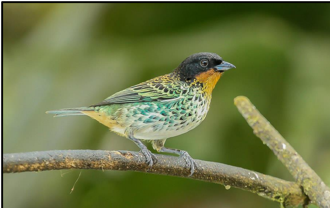
Rufous-throated Tanager, yet another beautiful tanager we hope to see in northern Ecuador.