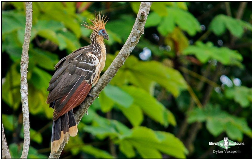
Hoatzin can be seen at the Napo Wildlife Center.

The Napo Wildlife Center offers also good opportunities to see wildlife such as Giant Otter , Black Caiman , Golden-mantled Tamarin , White-faced Capuchin , White-bellied Spider Monkeys , Red Howler Monkey , and Napo Saki monkey .