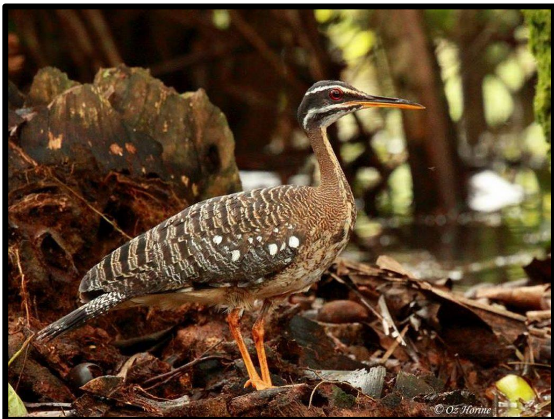
The highly sought-after Sunbittern should be encountered on this Amazon tour.

06 – 11 NOVEMBER 2022 26 NOVEMBER – 01 DECEMBER 2023